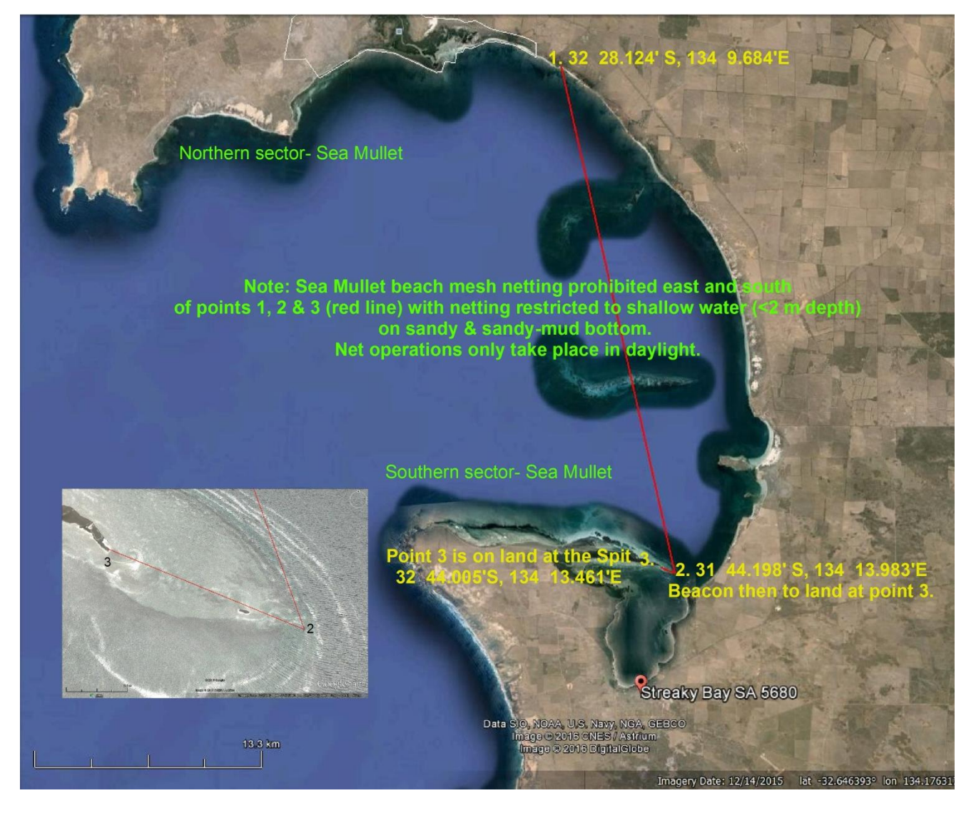
Figure 3 Proposed modification to PIRSA commercial netting closures to allow targeted Sea Mullet meshing in shallow (<2 m depth) water on sandy & sandy mud bottom west of the red line. Operations take place in northern and southern sectors of Streaky Bay west of the red line. Fishing restricted to the period March to mid-June (see Table 2).