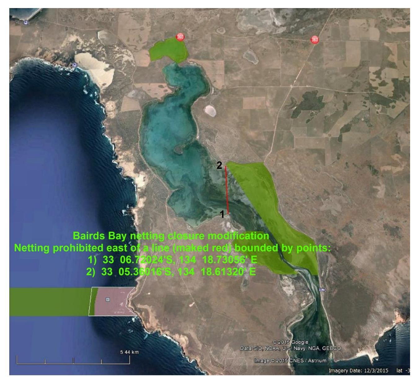
Figure 5 Bairds Bay. Proposed modification to PIRSA commercial netting closures to allow targeting garfish netting west of the red line (points 1 to 2) using floating mesh net. Operational restrictions include: minimum mesh size of 4.45 cm and surface drop of 91 cm with fishing prohibited in less than 1.5 m depth. The maximum available days totals 14 days/year (7 days in May & June), prohibit the use of mechanical net drums (see Table 2).